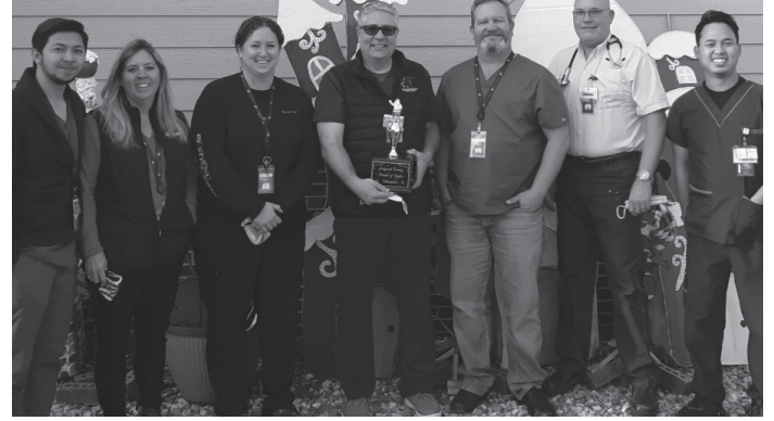
2021 Sedgwick County Parade of Lights Winners: Sedgwick County Health Center

Over the years, each parade has grown with more participants, spectators and events to draw the community together. Each community comes up with their own activities and events for the evening, including serving chili and hot chocolate, hayrack rides