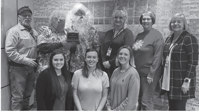
2021 Holyoke Parade of Lights Winners: Melissa Memorial Hospital Foundation Board.

As of this year, the Parade of Lights has been running in Holyoke for 24 years and Sedgwick County for seven years. Highline Electric Association and CHS Grainland are proud to co-sponsor this year's parades again, along with both of the local chambers of commerce.