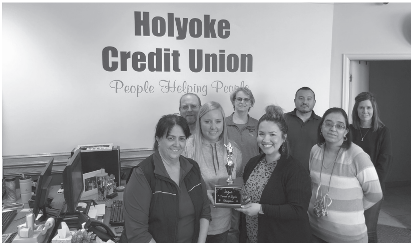
2020 Holyoke Parade of Lights Winner: Holyoke/Imperial Community Federal Credit Union.