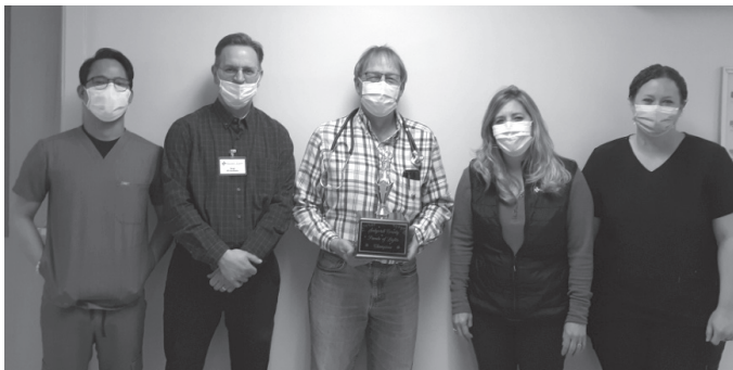
2020 Sedgwick County Parade of Lights Winner: Sedgwick County Health Center.

Watch www.hea.coop and Highline Electric's social media for dates, themes and other information regarding this year's parades.