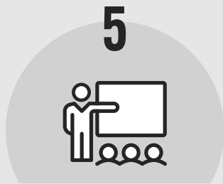
EDUCATION, TRAINING AND INFORMATION