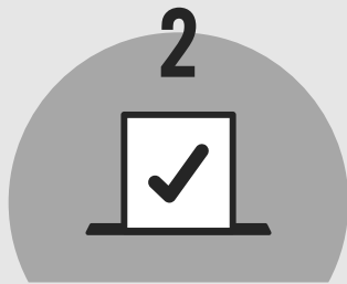
DEMOCRATIC MEMBER CONTROL