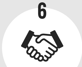
COOPERATION AMONG COOPERATIVES