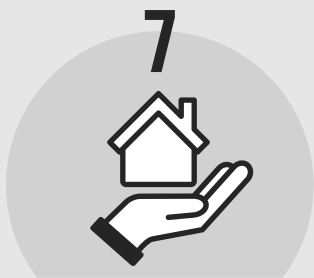
CONCERN FOR COMMUNITY