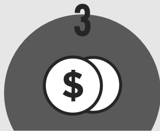
MEMBERS' ECONOMIC PARTICIPATION