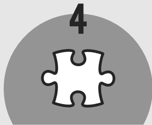
AUTONOMY AND INDEPENDENCE