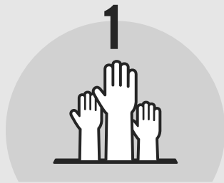
VOLUNTARY AND OPEN MEMBERSHIP